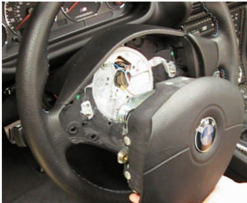
Figure 3. Airbag Partially Removed from Steering Wheel