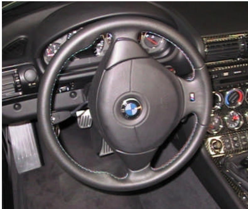
Figure 1. Steering Wheel Rotated to 9 O'clock position. 3 O'clock would be 180 degrees opposite.